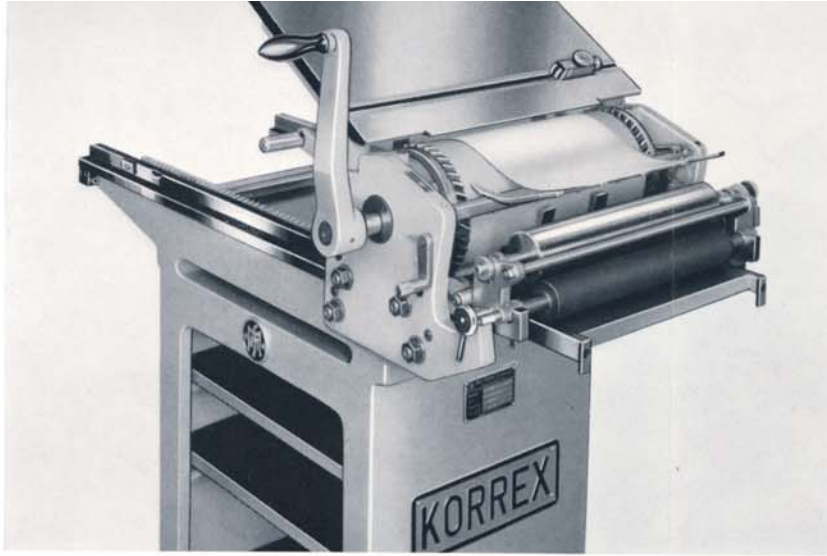
Impression cylinder at end of run